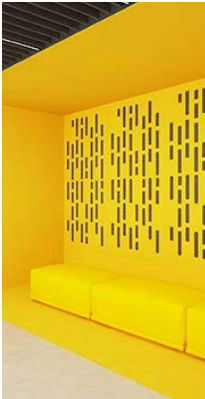
Acoustic panel detail